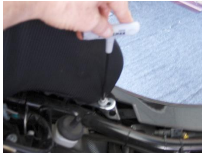
With wire cutter, snip away molded plastic from side-case mount supports.