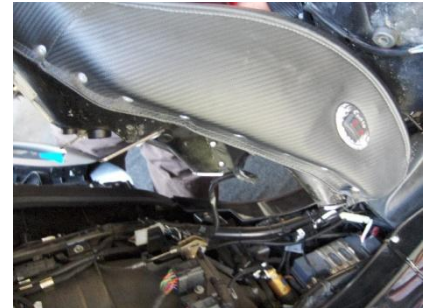
With chisel or Dremel tool, clear away excess plastic to flatten surface.