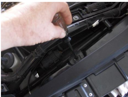
Install L&R mounting brackets Using the 2 wide flange Allen bolts