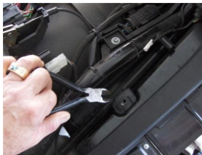
Make sure bracket is aligned with the outside edge of plastic, here.