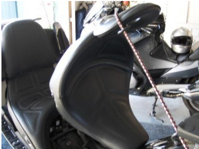
With T30 driver, or #5 Allen key Remove 2 screws left and right

Raise Pilot seat. Disconnect passenger heated seat plug. Remove 2 seat screws, set passenger seat aside.